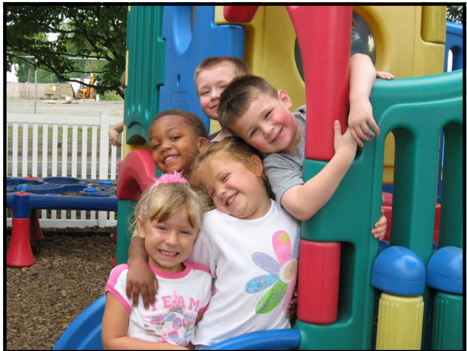
The young faces of our YMCA may be the future leaders of our community.