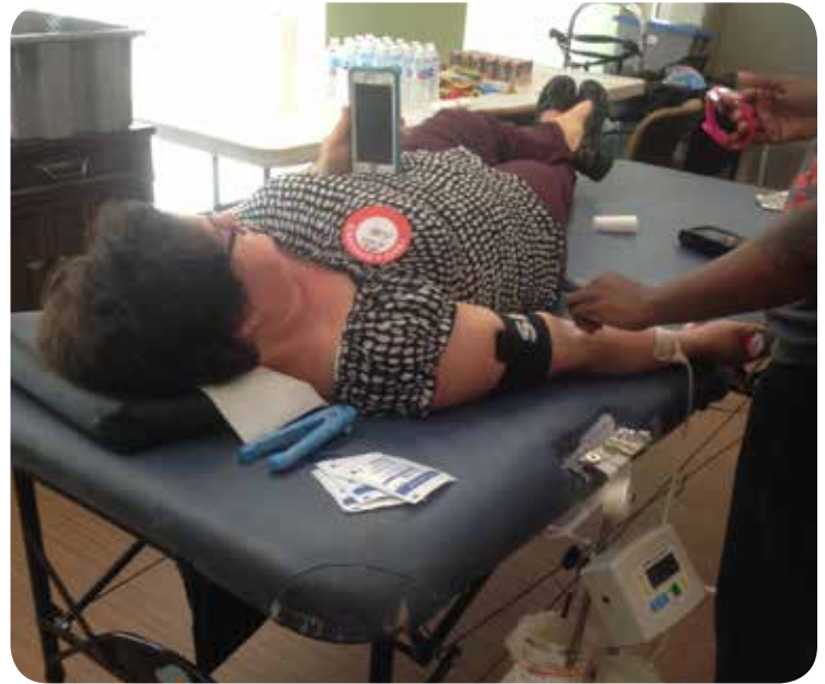
Blood Drives are held in the North Penn Commons Lobby and the Indian Valley branch.