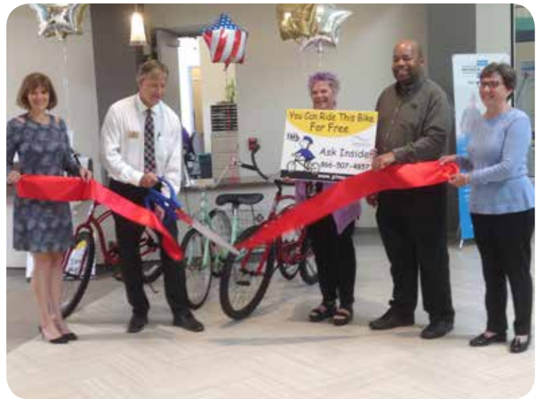
The North Penn YMCA teamed up with Partnership Transportation Management Association of Montgomery County (PTMA) who works with local businesses, municipalities, school districts and other non-profit organizations to help reduce traffic congestion, increase mobility and access to work and educate children and adults on the issues of land use, transportation, the environment and healthy lifestyles.