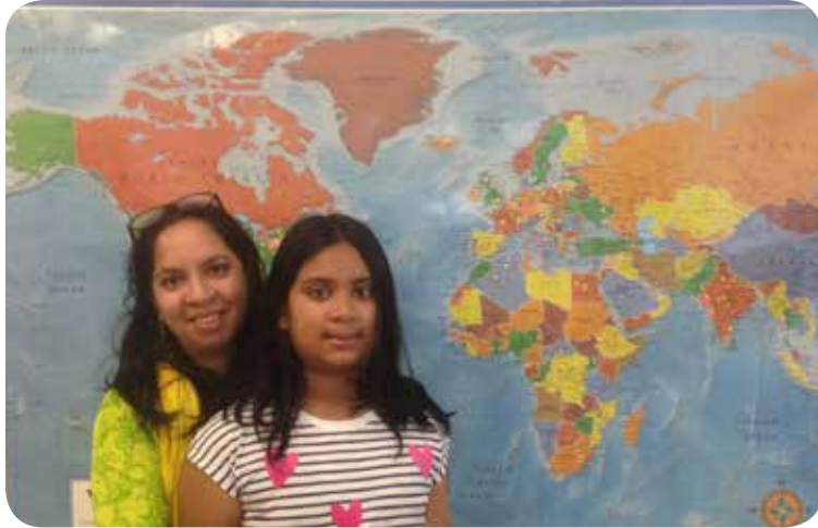
Celebrating our diverse membership by marking the country we identified with during Welcoming Week.

More than ever, it's become evident than ever that no single organization can move the needle alone. But when nonprofits partner together, it creates effectiveness and strength in a community that's difficult to beat.