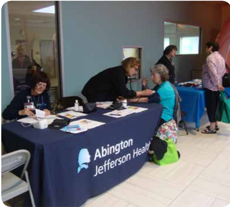
Health Fairs brought in community organizations to serve our members and individuals within our communities.