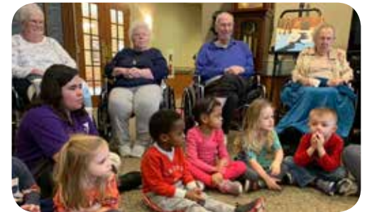
YMCA HUGS Day Care participants with Peter Becker Community residents.

At the Y, we are fortunate to have many incredible community partners including: